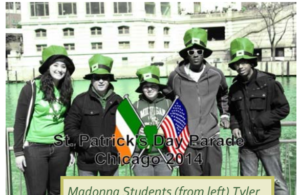
St. Patrick's Day Parade Chicago 2014

St. Patrick's Day happens each year on the 17th of March, and is a celebration of the patron saint of Ireland, St. Patrick. Because Irish immigrants are very prominent around this area and have played a very big part in the development of Detroit, there are many St. Patrick's Day events to commemorate the holiday. One of the most well-known events is the St. Patrick's Day Parade in Detroit. This year the parade was held on Sunday, March 16, and wound through the Irish neighborhood of Corktown in Detroit, which is also one of Detroit's oldest neighborhoods.