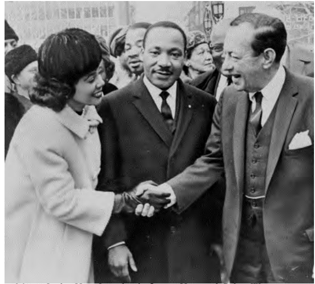
Martin Luther King, Jr. and wife, Coretta King, with Robert Wagner

King was a pastor in the Baptist church as well as one of the most famous American civil rights activists. He was a leader of the African-American Civil Rights Movement in the 1950's and 1960's which fought to prohibit racial discrimination and segregation. Inspired by the teachings and practices of Gandhi, as well as the teachings of his Christian faith, Dr. King advocated for the use of non-violent forms of protest, such as marches, sit-ins and other forms of civil disobedience. Dr. King's most famous speech is the "I Have a Dream" speech that