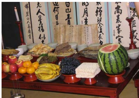
Jesasang , ceremonial table setting.

Often people wear traditional clothing, called hanbok , and in many areas folk games are played like tug-of-war, archery, and Korean wrestling, and traditional Korean dances are performed.