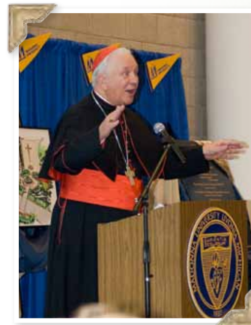
▲ Cardinal Adam Maida shares his enthusiasm for the new building and for all of the good work taking place at Madonna.