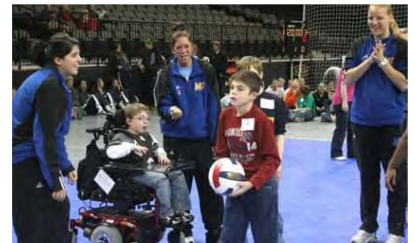
Top: The women's basketball team and the Monroe Eagles Special Olympians.