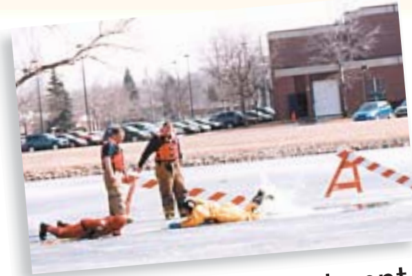
Livonia Fire Department

During the week of March 17, the Livonia Fire and Rescue team practiced ice rescue training drills on Madonna University's St. Francis Pond.