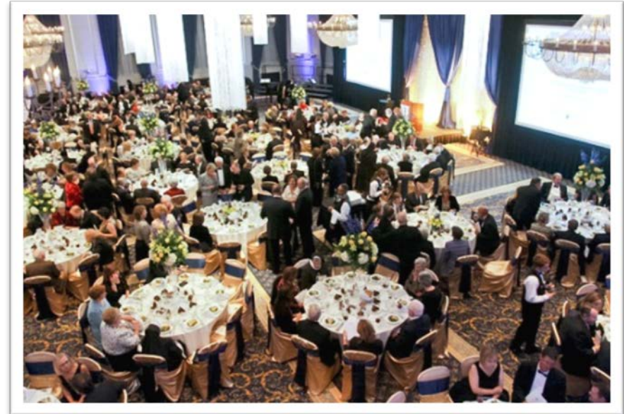
The Madonna University Chorale entertained the Diamond Jubilee guests.