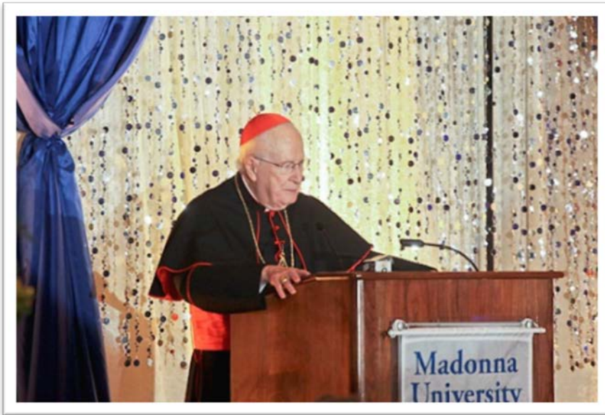
Edmund Cardinal Szoka gave the benediction.