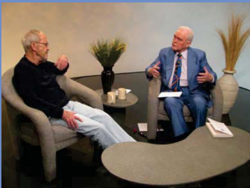
The guests are- first Elmore Leonard