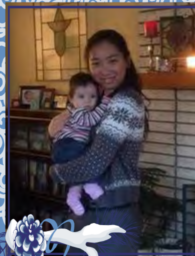
Fang with Gary's adorable grandson!