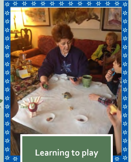
Learning to play Dreidel