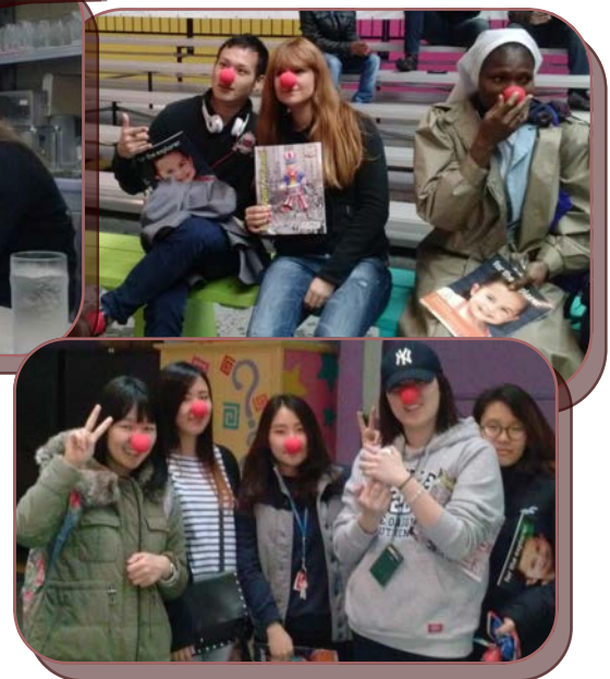
(We all got to be clowns for a day!)

During the tour we learned that the Parade, now includes more than 75 pieces, including floats, wearable heads, and balloons. The parade has been put on every year since 1924, (except for 2 years during WWII, when